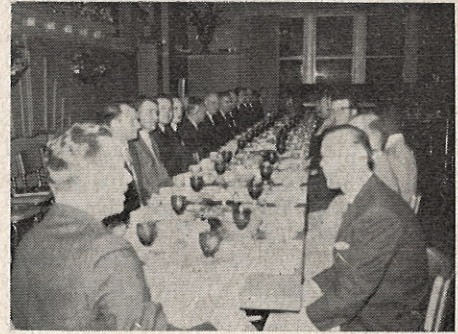
SPOKESMEN GATHER FOR DINNER

those who are really a part of its functions. We know that through it we shall be properly equipped to give an answer for the hope and the faith which are within us.